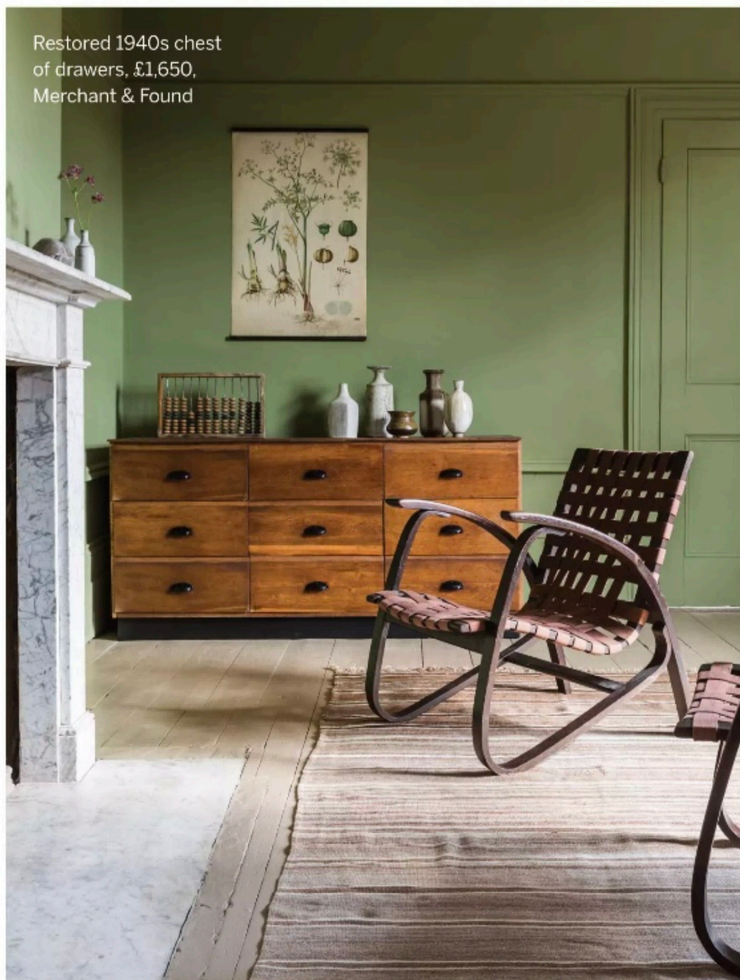
Restored 1940s chest of drawers, £1,650, Merchant & Found